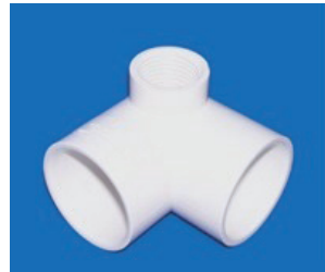
Side Outlet Elbow

We have a wide range of these threaded pressure fittings available. Use the table below to determine if we can help you with the right fitting for your job.