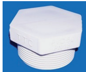
Threaded End Cap